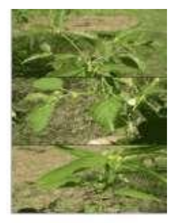
Figure-1; Jute Fiber

Lignocelluloses fibers are favorably bonded with phenolic resin to have better water resistance rather than urea or melamine resin. Hence, water soluble phenol formaldehyde resin was selected for the development of rigid jute board for good serviceable mechanical properties. To achieve better wet ability of jute with resin and to improve strength properties, fiber pre-treatment is necessary. Simple pre-treatment is done with lowcondensed resins like melamine resin, phenolic resin and CNSL modified phenol formaldehyde resin. Indicative physical properties composites from untreated & pre-treated jute nonwoven with PF resin are shown in Table Jute as other lignocelluloses fibers consists of –OH group which causes it susceptible to moisture and directly impairs the properties of jute composite specially dimensional stability. Due to this polar group, jute also is not efficiently adhered to non-polar matrices. To overcome this difficulties this fiber should be modified chemically or hydro-thermally. To improve the interface adhesion between the non polar matrices and hydrophilic fiber, coupling agent or compatibiliser should be used.